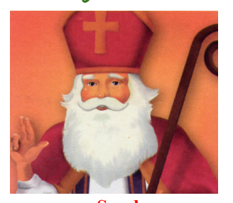
Sunday 5th December 10am ALL WELCOME

St Nicholas Parish Church Invites all families to the Family Celebration of the Geast of St Micholas